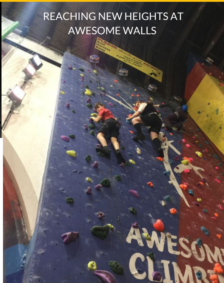
REACHING NEW HEIGHTS AT AWESOME WALLS

Children have a 'can do' attitude at The Observatory School. They are not afraid to have a go, they aim high and challenge themselves through a deep-rooted desire to fulfil their potential.