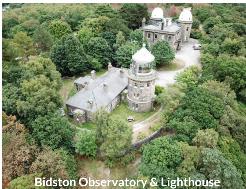
Bidston Observatory & Lighthouse

The school is set in several acres of leafy grounds and we are bound by forests & greenbelt land. Everything that our children need is on-site, from the state of the art classrooms to sports pitches, sensory play areas & highly specialist social, emotional, and mental health (SEMH) & Autistic Spectrum Condition (ASC) Nurture Bases.