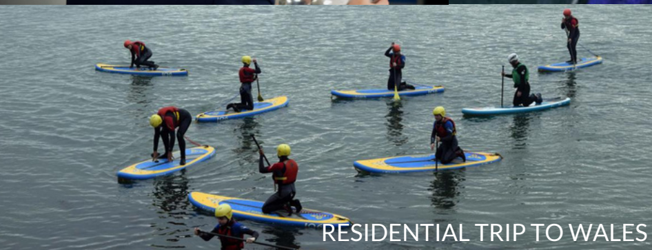
RESIDENTIAL TRIP TO WALES