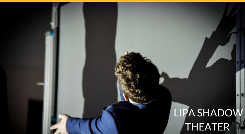
LIPA SHADOW THEATER

WORKING TOGETHER TO REACH OUR FULL POTENTIAL